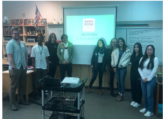
Final Presentations at Montgomery High School.

The Project team collaborated with the teachers to design a curriculum which was divided in five steps with a flexible schedule to meet the classes' needs.