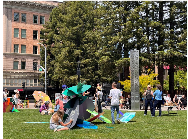
Art Instalation “Journey to the Future, Court House Square.

The data collected through workshops was incorporated into an interactive art installation reflecting the dreams of the youth. The art pop-up was displayed in Court House Square on May 21 st , 2023 and will be displayed at different times, including SR Forward community workshops.